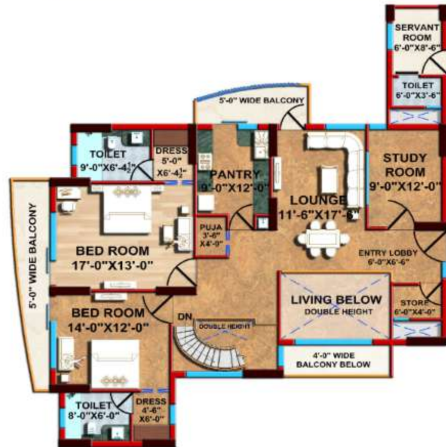
Level - 2